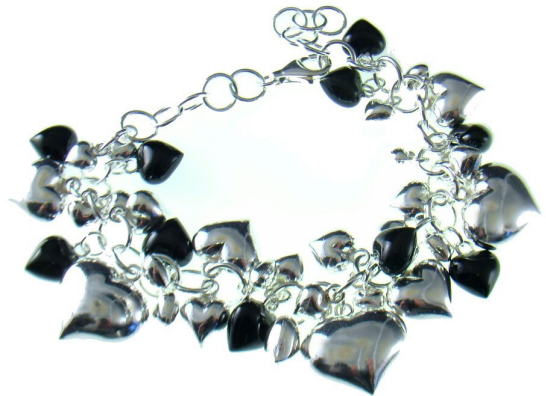
Sterling silver and Black Enamel-Hearts bracelet

If you would like to have a look at the web site simply register on line and we will activate your account within 24 hours.